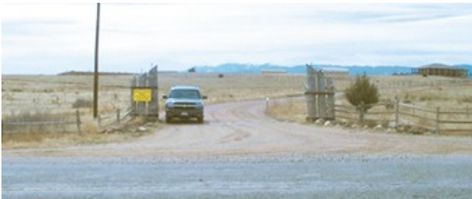
RCR-N Entrance prior July 2011