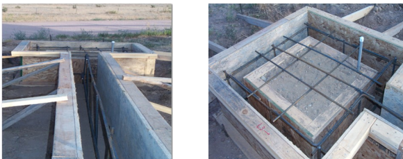
Forming New Entrance