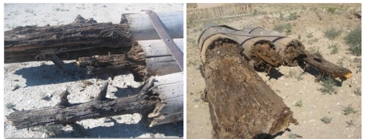
Removal of old posts on the west side of the Entrance!